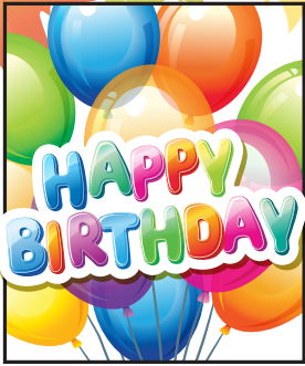
Alexis Krait Oct 2